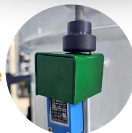
WITH SAFETY SENSOR