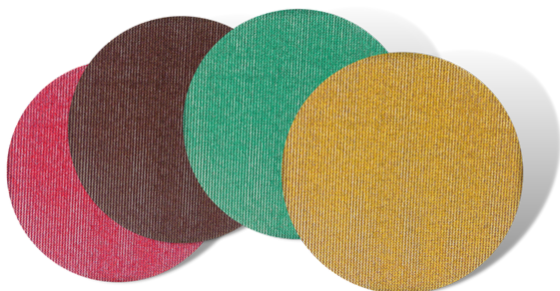
COMPATIBLE WITH 125MM 5" SANDPAPERS