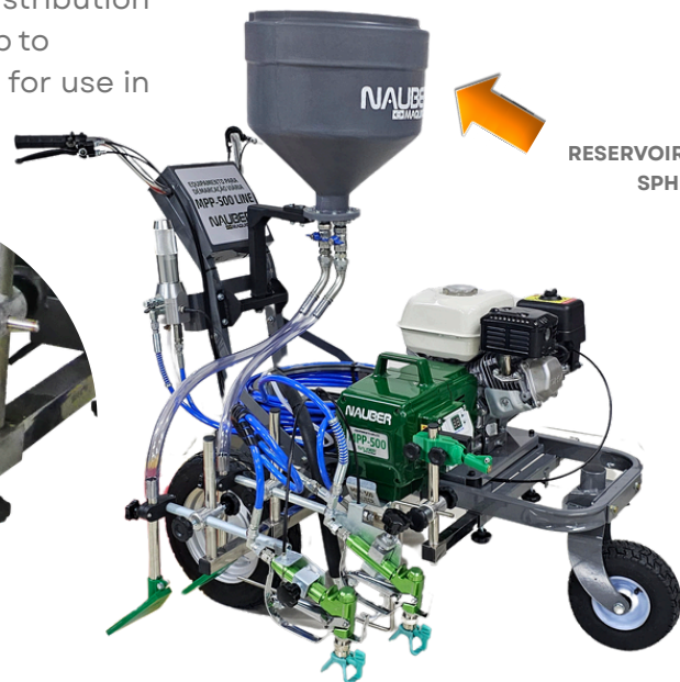
RESERVOIR FOR REFLECTIVE SPHERES (30L)