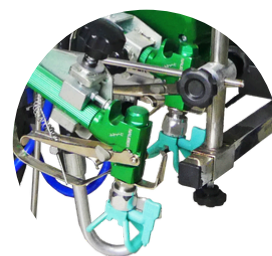
2 SPRAY GUNS FOR MARKING ON DOUBLE STRIPS